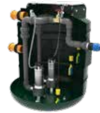
800 L Twin Model