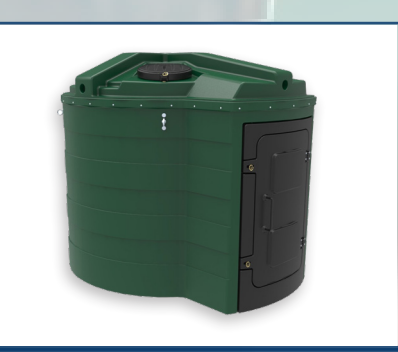
5000 Litre Fuel Station