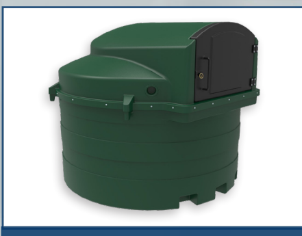
3500 Litre Slimline Fuel Station / Fuel Point