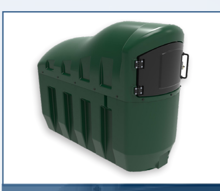
1300 Litre Slimline Fuel Station / Fuel Point