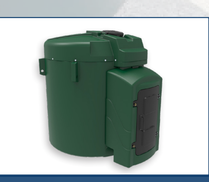
9250 Litre Fuel Station