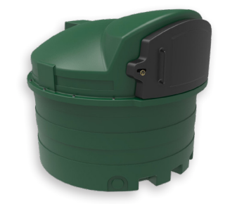
2500 Litre Fuel Station / Fuel Point