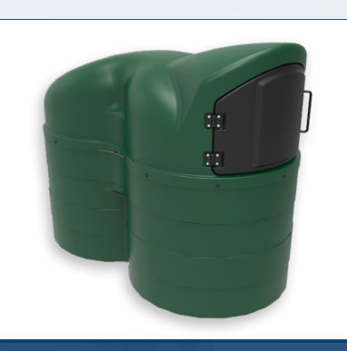
2500 Litre Slimline Fuel Station / Fuel Point