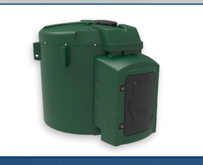
7500 Litre Fuel Station